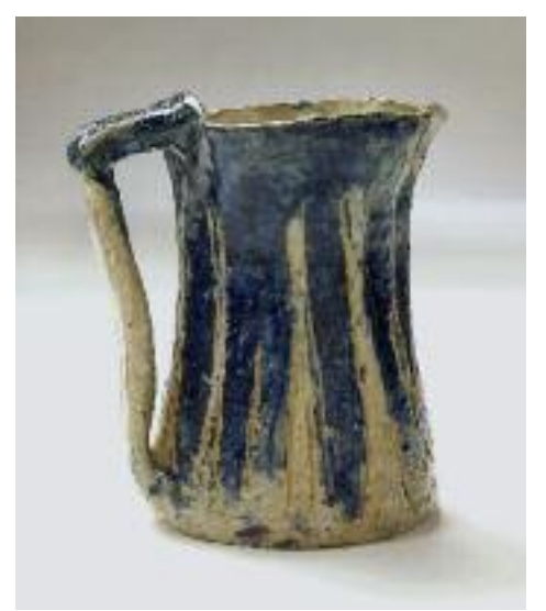
Merric Boyd, 'Jug with Trees', 1942, ht 15.8 cm Arthur Boyd, 'Angel and Ramox', 1948, plate, diam. 45 cm