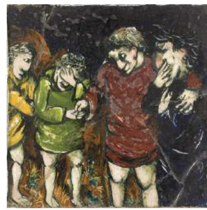
Arthur Boyd, '30 Pieces of Silver', c. 1950, glazed earthenware tile