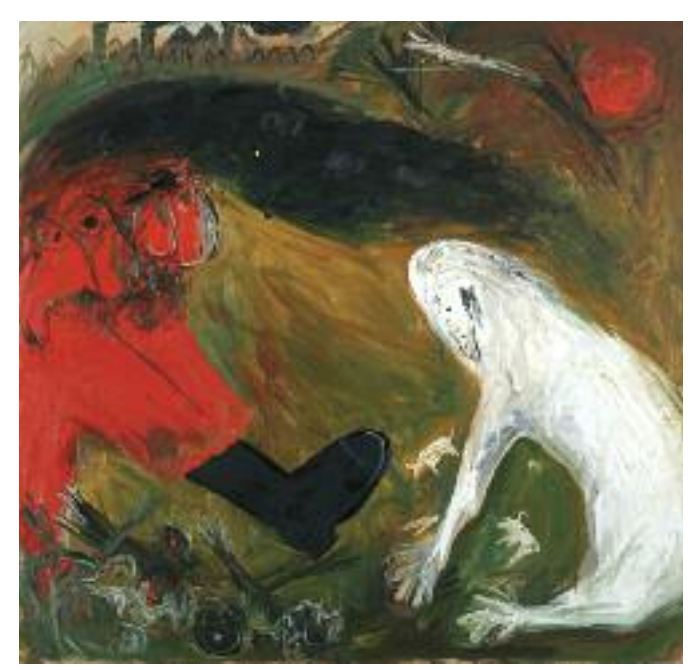
Arthur Boyd, 'Man with Fallen Fowers and Dog', c. 1966, oil on canvas, 108.8 x 113 cm. This painting includes recurring symbols of Merric's boots, a shaking epileptic figure, Peter the family dog and the ramox

Arthur Boyd, 'Coffee Set with Roosters, 1947, wheel-thrown earthenware